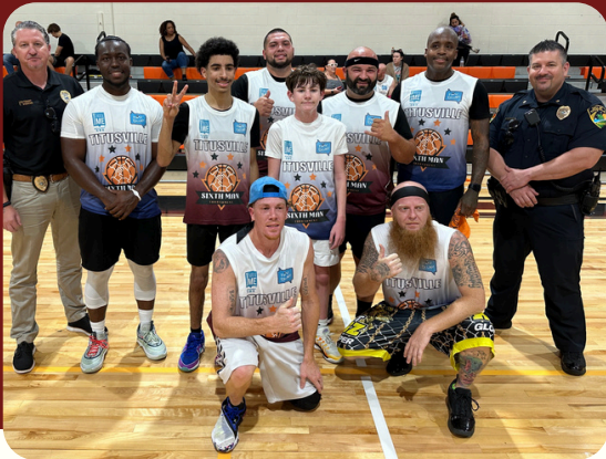
Titusville Police and local kids take 2nd and 3rd place @ the 6th Man Basketball tournament in Cocoa