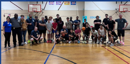
The Titusville Police Department basketball team participated in basketball games at the YMCA during their teen night event!

For more information on community events: 321-223-5316