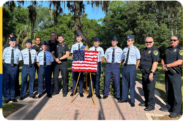
"City of Titusville Memorial Celebrations" presentation of colors by the Tico Civil Air Patrol - FI 267 cadets.