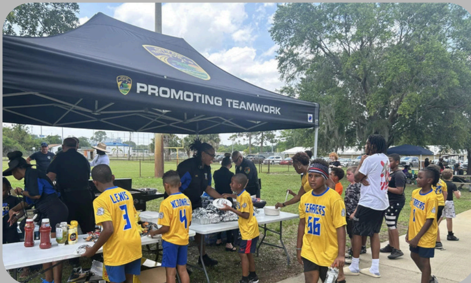
Titusville Police grilled and served hotdogs with all the fixings to community members during the "Cooking Out with Cops" supporting the Titusville Terrier Youth Sports Association